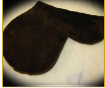
Dark Brown Working Hunter Jumping/Hunting/Cross Country

Optional detachable Riser Pads/ Wither Pads/ Full length i.e. double thickness