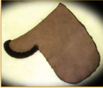
Dark Brown Showing Numnah Turned edge round seat only

Optional detachable Riser Pads/ Wither Pads/ Full length i.e. double thickness