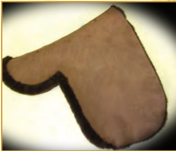
Dark Brown Showing Numnah with Turned edge round seat and back of flaps

Detachable Half Risers/ Wither Pads for wasted Muscle Problems etc.