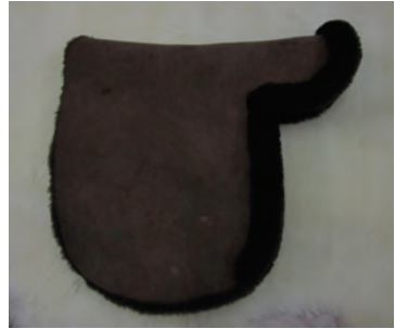
Dark Brown Working Hunter Numnah with turned edges around seat and back of flaps

Detachable Half Risers/ Wither Pads for wasted Muscle Problems etc.