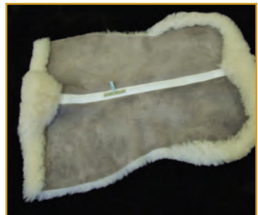
Close Contact Ivory Jumping/ Dressage Numnah.

Shetland Pad Non slip mesh Pad with Sheepskin Trim (not pictured)