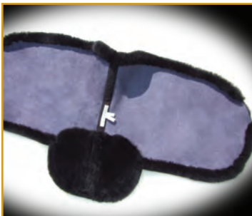
Black Showing Numnah Turned edges all round Optional, detachable Riser Pad.

Shetland Pad Non slip mesh Pad with Sheepskin Trim (not pictured)